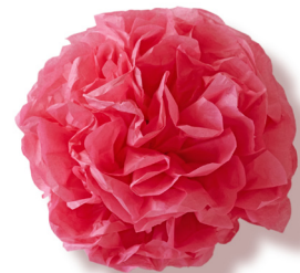
Illustration 2: Cut off corners for pointy petals